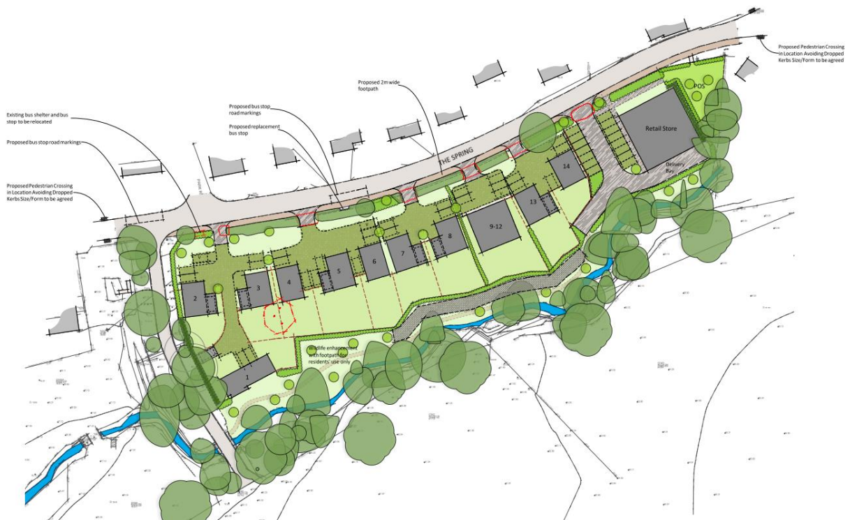
Site Layout / Block Plan

To the rear of the site there is a proposed footpath with wildlife enhancement area; the existing vegetation within this area will be maintained and additional planting will take place.