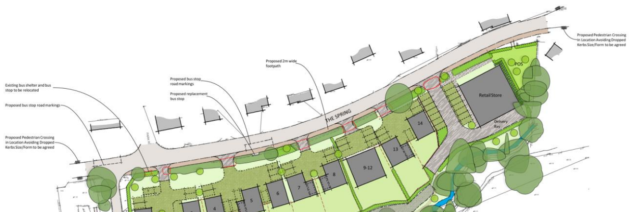
Extract from proposed Illustrative Masterplan

The application is in outline form with all matter reserved except for access. The application proposes six new accesses off the B3098, as shown in the extract below. Starting to the west of the site, the proposed access would serve plots 1-3, the next plots 4-6, the next plots 7 and 8, the next plots 9-12, the next plots 13 and 14 and finally the proposed access to the retail store. The scheme proposes a two-metre-wide footpath across the site frontage with a new location for the bus stop and two new pedestrian crossing points to the east and the west of the site.